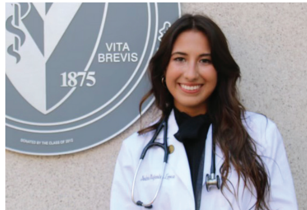
How It’s Going