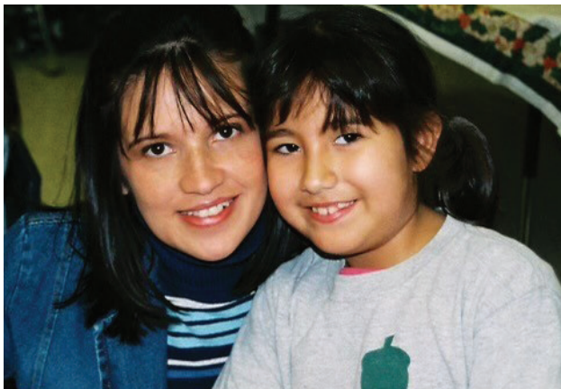
How It Started